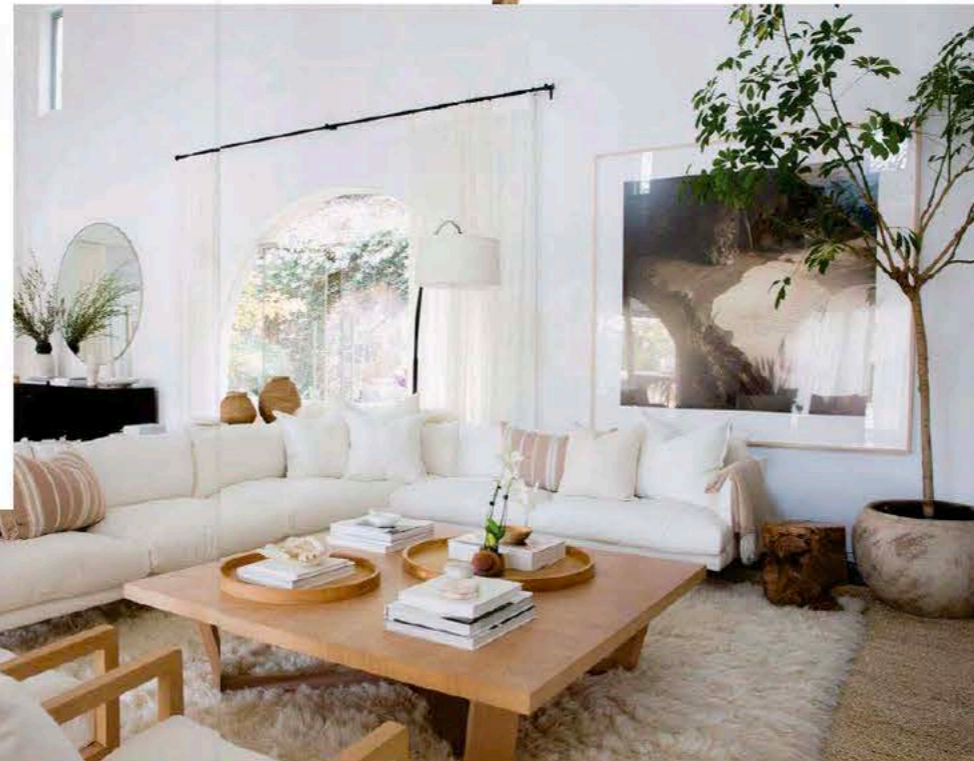
CALIFORNIA DREAMING: A colour palette of whites and earthy tones make for a chilled-out vibe